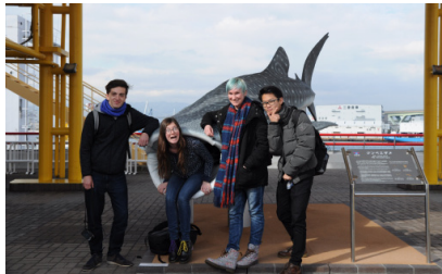
A visit to the Osaka Aquarium

My research is similar to this situation, but with different-sounding noises instead of different-looking apples. I have already written all of the MATLAB programs I need. Within the next month, I will get to use the lab's