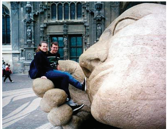
Les Halles, Paris

While it is possible for Cognitive Science majors to go at almost any point in their academic careers, the particular quarter, semester, summer or year that you study abroad depends on your individual progress in your major and what courses you plan to take while abroad. See Requirements section below for more information.