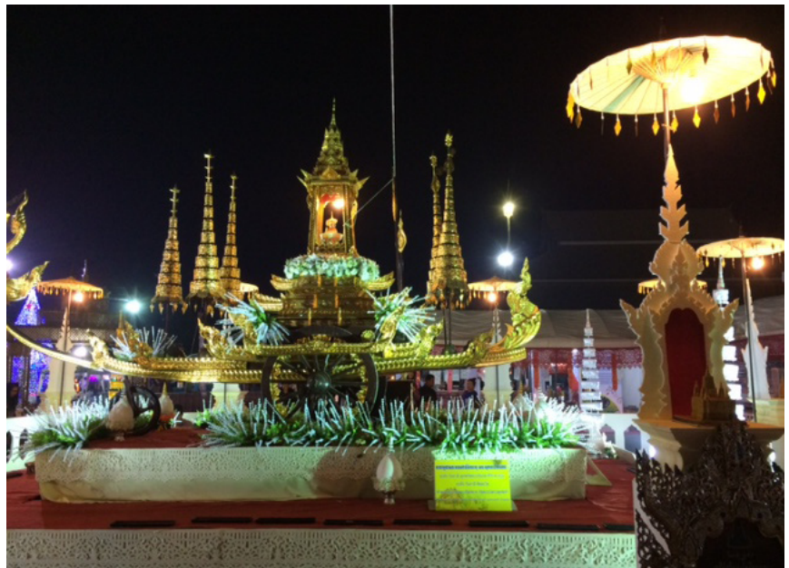
Beautifully-lit shrine at a festival in Chiang Rai