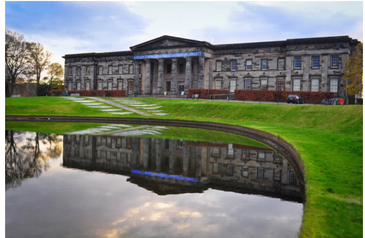
Scottish National Gallery of Modern Art, Edinburgh

Education Abroad Program, Scottish Universities Marshall College, Computer Science major