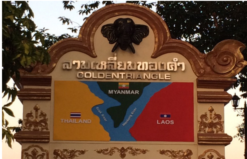
Golden Triangle: Thailand, Myanmar, Laos