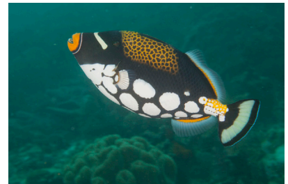
Clown triggerfish on Raja Ampat reef