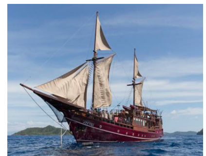
The dive boat Arenui under sail