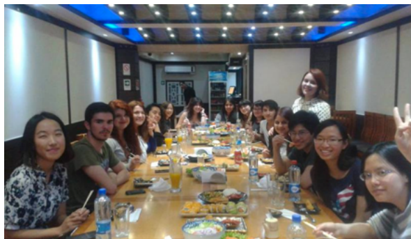
Asian Study Group at La Católica

Being in Chile has also built me up professionally. After visiting several companies and organizations during the first month, I began to work for Acción Emprendedora (AE), a non-profit committed to supporting start-ups in Chile. Although I did not acquire technical knowledge or experience to be a business professional while working at AE, I was able, for the very first time, to work with many people from different