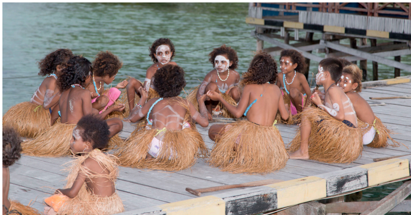
Local children in a Raja Ampat village getting ready to dance for a visiting government functionary